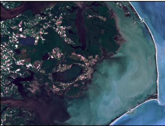
The North Carolina coast after Hurricane Floyd.

RJG&A scientists have experience with water supply and wastewater utility projects, parks and trails, highways, landfills, mining, and private and institutional land development projects. RJG&A enjoys an outstanding reputation for quality, creativity, and reliable service with clients and agencies, including the US Army Corps of Engineers, NC Division of Water Quality, NC Wildlife Resources Commission, NC Ecosystem Enhancement Program, Clean Water Management Trust Fund, and many others.