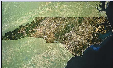
Satellite imagery of North Carolina